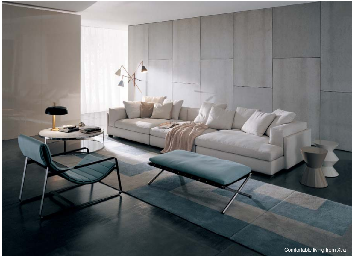
Comfortable living from Xtra