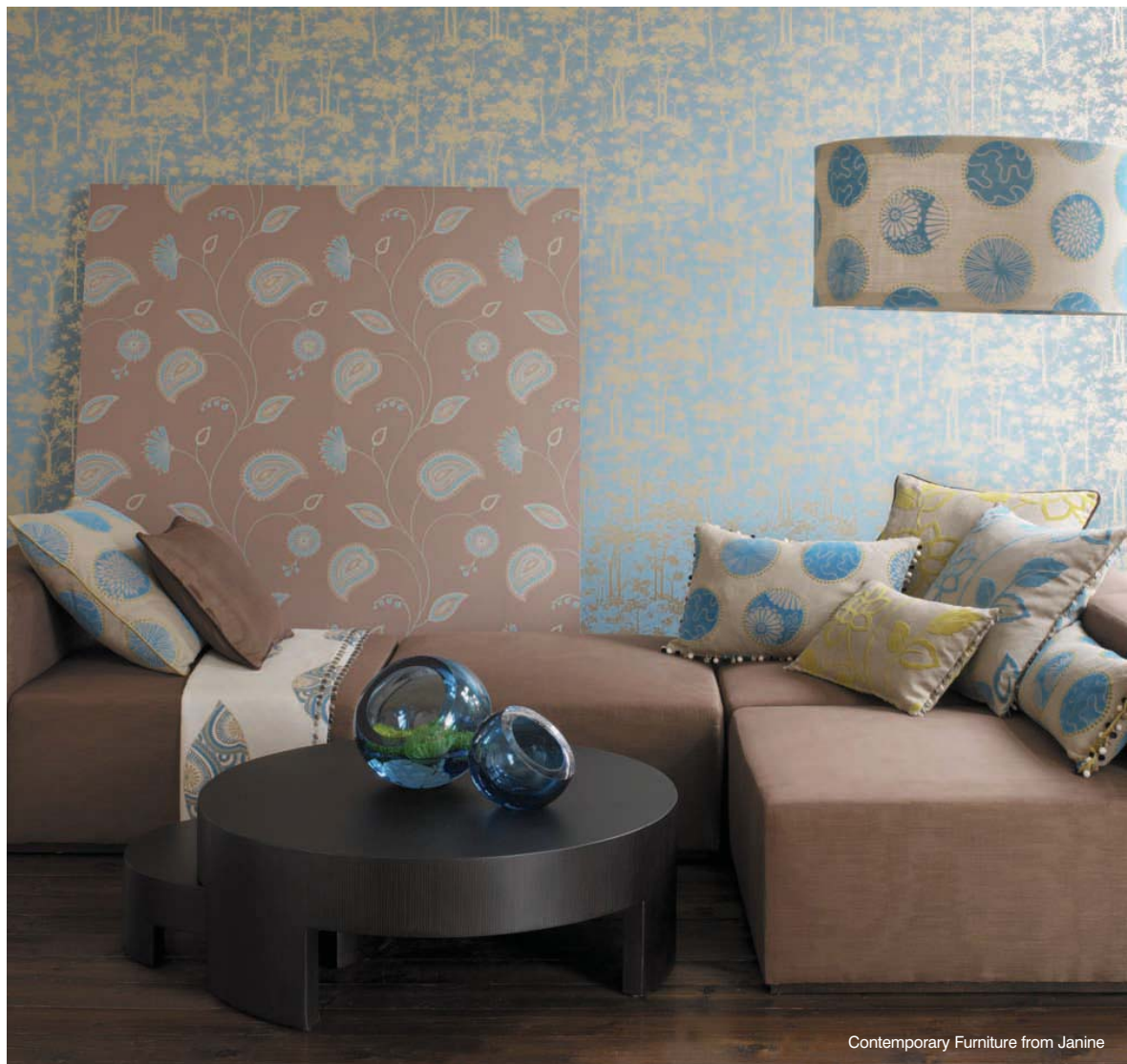
Contemporary Furniture from Janine