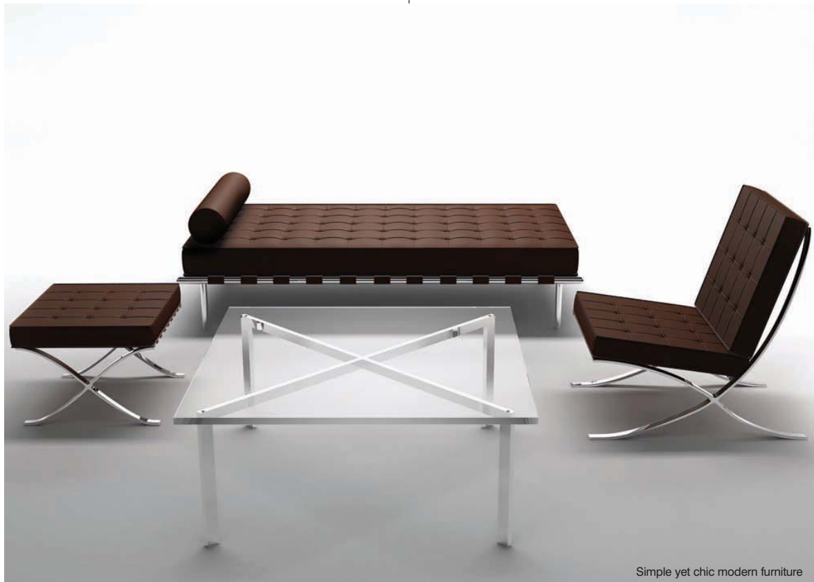
Simple yet chic modern furniture